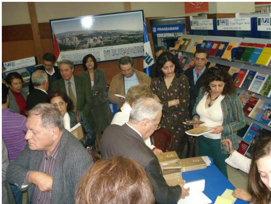
A view of NDU's busy stand at the Book Fair (Mar 2010).